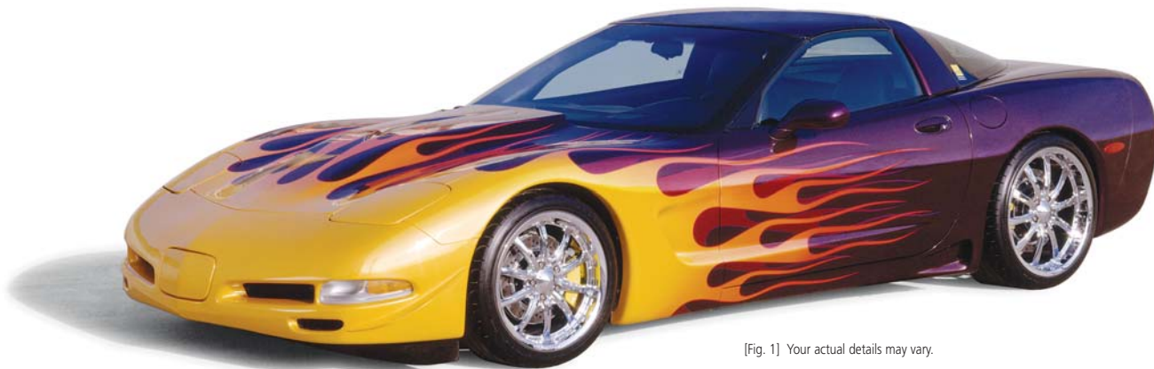
[Fig. 1] Your actual details may vary.

Beauty is only skin deep. But cool goes all the way down to the frame.