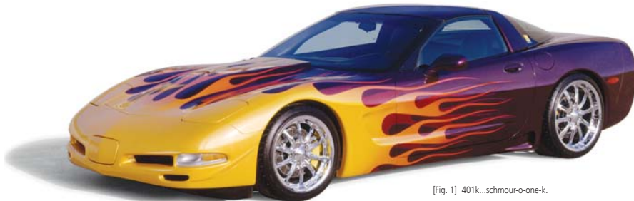
[Fig. 1] 401k...schmour-o-one-k.

Some will say that car is a foolish waste of money. Of course you won't be able to hear them over the high performance exhaust.